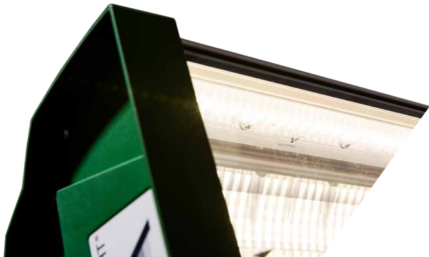
White light of the AGRILED® 3

Together with our European dealers and their end customers (European dairy farms), we have developed a new assortment of luminaires. The new product range consists of 3 types and 5 variants of luminaires to meet the light needs of every type of livestock.