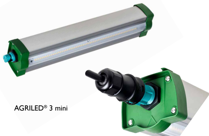
AGRILED® 3 mini