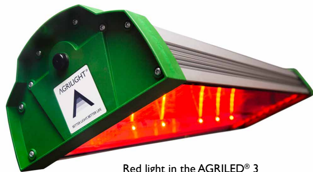
Red light in the AGRILED® 3

AGRILED® 3 mini - Multi-purpose luminaire for lower barns (< 3,0m), milking parlours & waiting area.